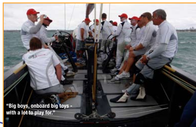
"Big boys, onboard big toys - with a lot to play for."